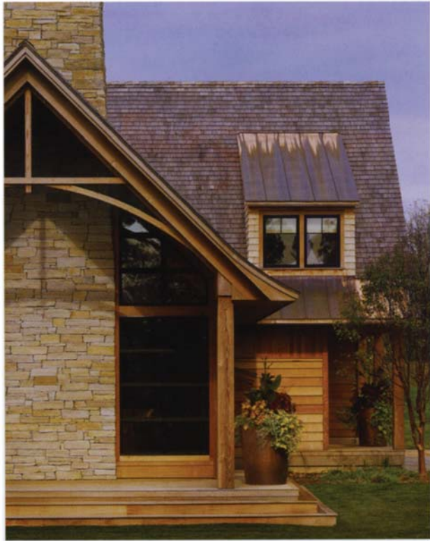
The exposed exterior materials are naturally weathering cedar, copper, and stone. No preservatives were used, which will let the building age gracefully and grow more beautiful over time. Courtesy of Jim Westphalen

The home is nestled into the west facing hills above the lake, so that the visitor does not see the structure until approaching it. In this way, it is respectful of the surrounding landscape and preserves the views of the Adirondack Mountains for those neighbors further up the hill. This nestling also gives the owners and their young children a wonderful sense of arrival and refuge. Courtesy of Jim Westphalen